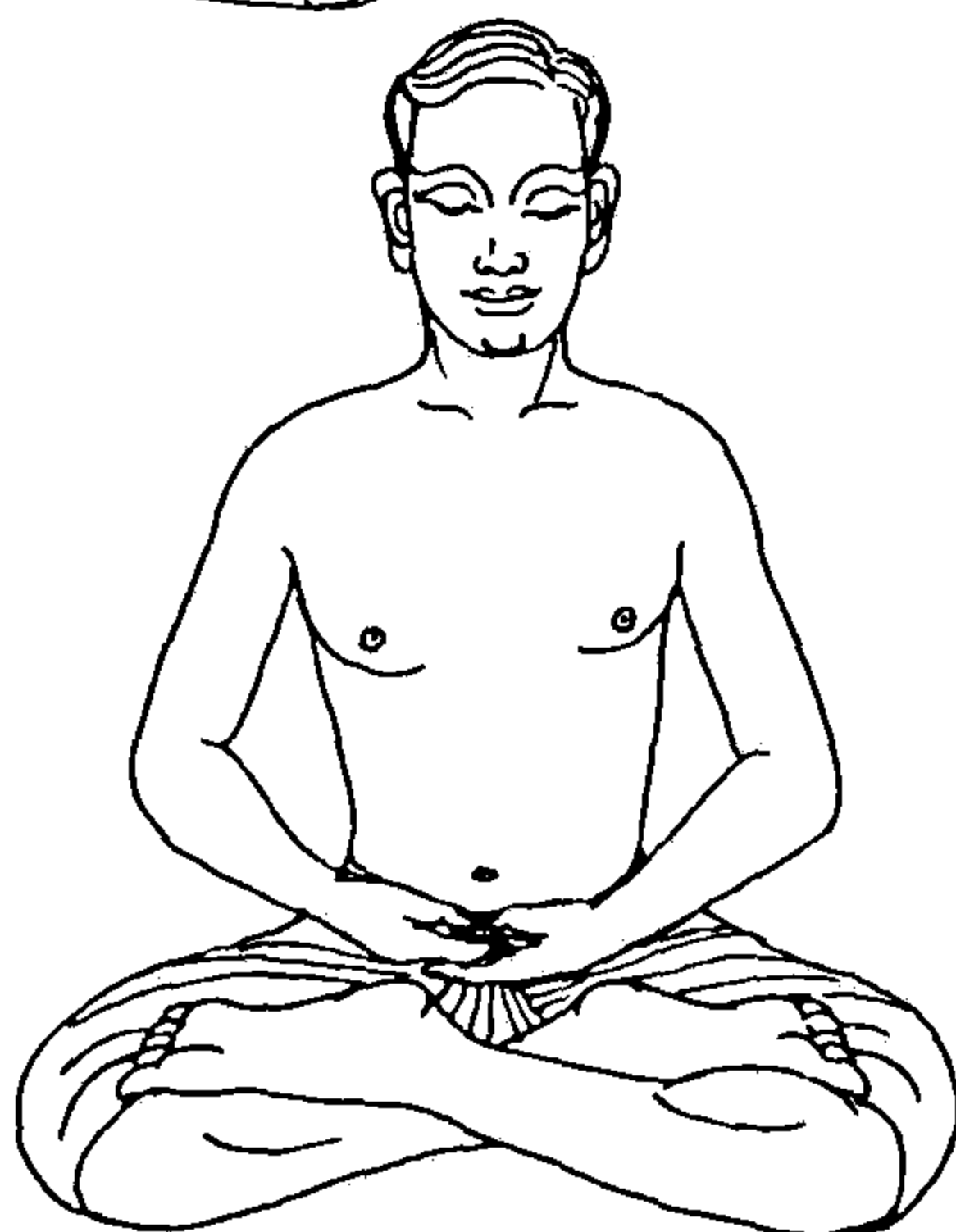
SITTING POSTURES (with various hand positions)